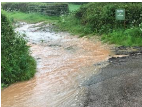
White Cross Road Woodbury Salterton Surface water flowing off field. There is a ditch on the field side of the hedge is could go into.

Toby Lane The ditches are running well until entrance to bungalow where a pipe takes the flow under and across the road but is blocked. However taking the stormwater from there is problematic as the ditch then goes through a number of residential gardens and a different solution needs to be found Ideally we need to slow and reduce the flow to help reduce the flow downstream